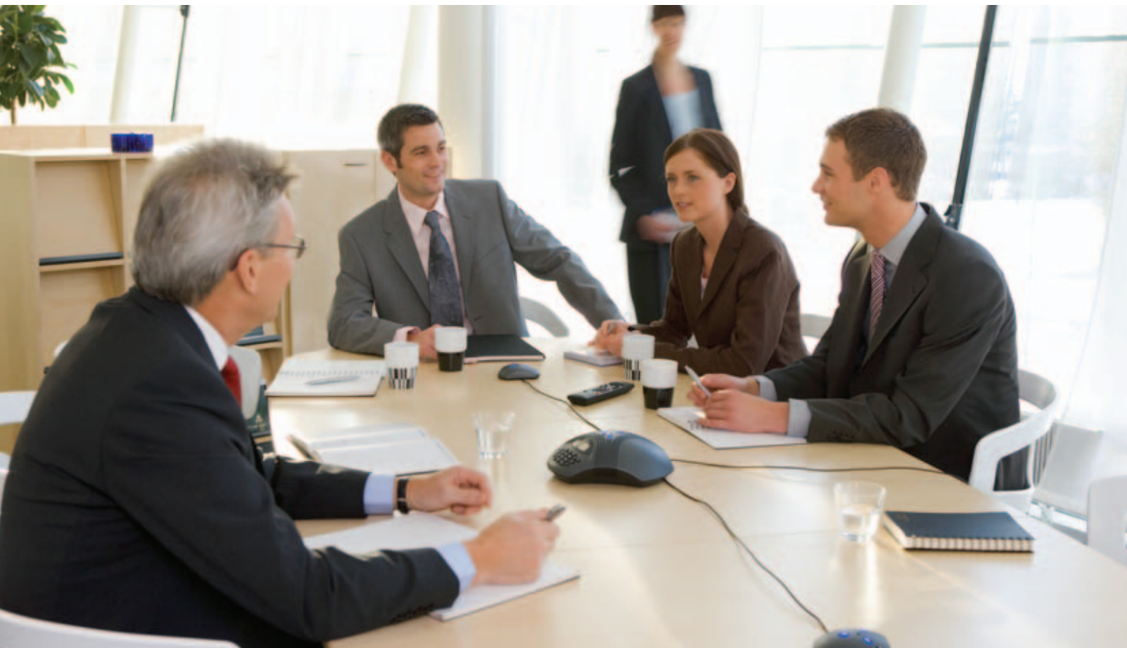
Conference phones for every situation